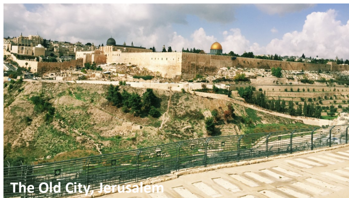
The Old City, Jerusalem

This morning, we drive to the top of the Mount of Olives. Here, we will have a panoramic view of Jerusalem and receive an explanation from our guide. We will visit the Place of the Ascension before we ascend the Mount of Olives by foot and visit the Pater Noster Church. Continue to the Gethsemane, where we visit the Basilica of the Agony. We then walk from the foot of the Mount of Olives to Mount Sion where we will visit the Cenacle, the site of the last supper and the Church of St. Peter in Gallicantu where we remember Peter's denial of Jesus. Lunch in Jerusalem at Petra